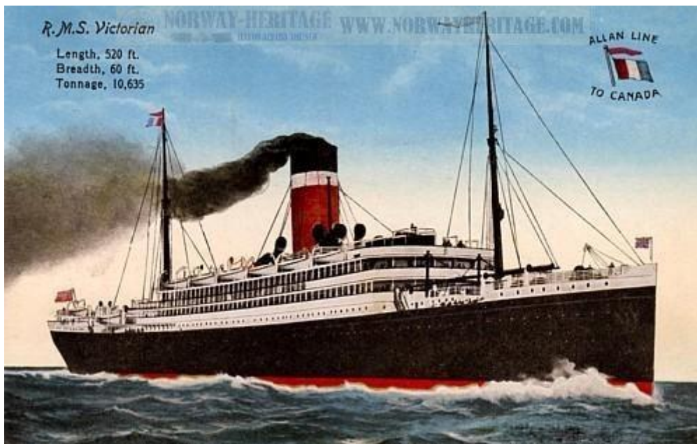
Steamship S/S Victorian